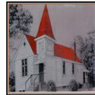
Wehrman Avenue – 1908 - 1964