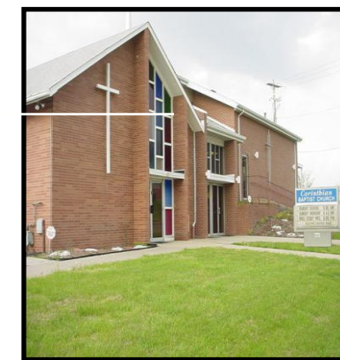
Whittier (w/Addition) – 1991 - Present