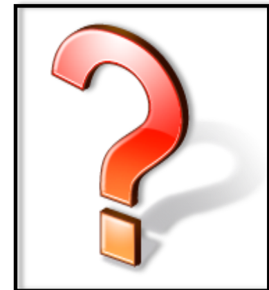
Future Home of CBC - ???