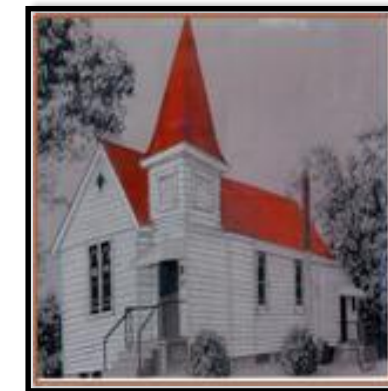
Wehrman Avenue – 1908 - 1964